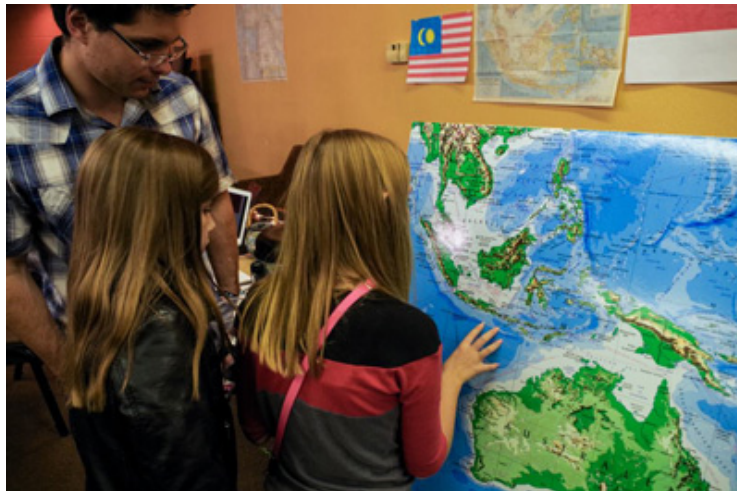
YWAM Redding prays for the persecuted Church

Join YWAMers around the globe in praying and hearing from God. He is inviting you!