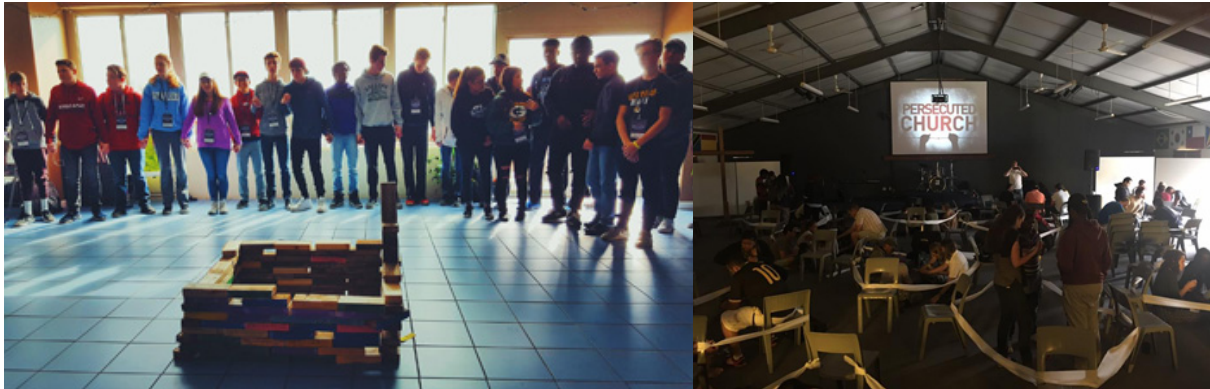
YWAM Prays for the Persecuted Church